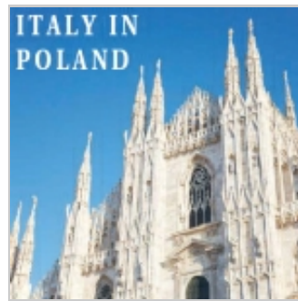
The Warsaw Voice Special Section