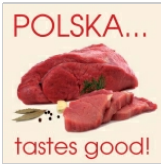
The Warsaw Voice Special Section